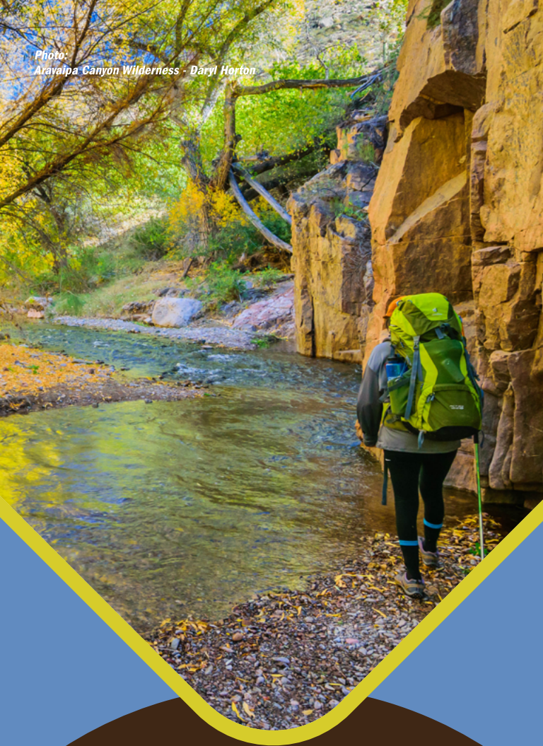
Aravaipa Canyon Wilderness